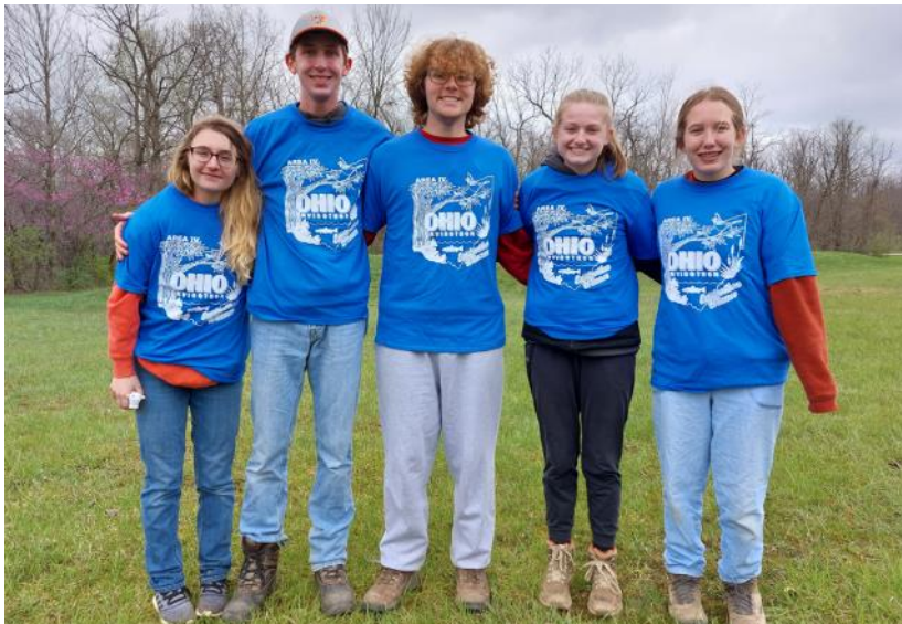
2022 Area 4 Envirothon winners for Centerville Highschool advanced to the State Envirothon competition held at Miami University in Oxford, Ohio in July of 2022 .

Students who participate gain a greater awareness of natural resources and environmental issues, a better understanding of interrelationships between living and non-living components of the environment, and an increased interest in further science study. The Envirothon is designed to take youthful curiosity one step farther, by getting involved and getting educated in environmental and natural resource management topics.